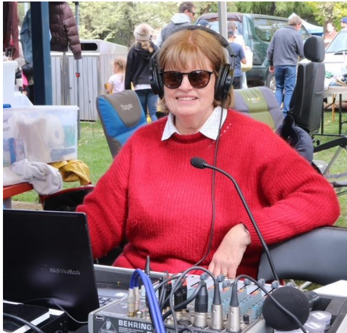
Berridale Easter Fair 2023 Live Broadcast